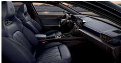
PETROL BLUE + DARK ALUMINIUM DECORATIVE INSERTS