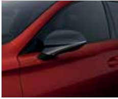
DESIRE RED** OP