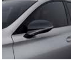
URBAN SILVER* ST