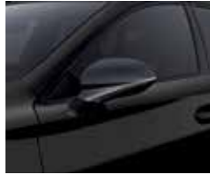
MIDNIGHT BLACK* ST