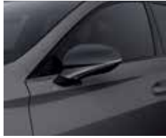
GRAPHENE GREY** OP