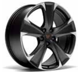
19" MACHINED ALLOY IN SPORT BLACK & SILVER